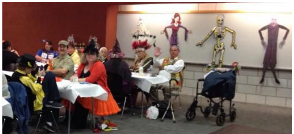
All dressed up for the Halloween Party